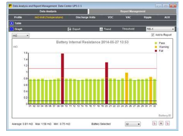
Histogram of a battery string with user defined threshold.